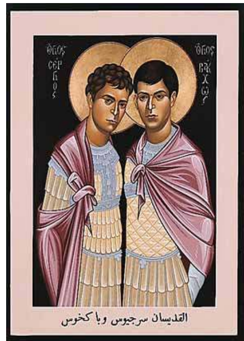
Saints Sergius and Bacchus -Pray for us