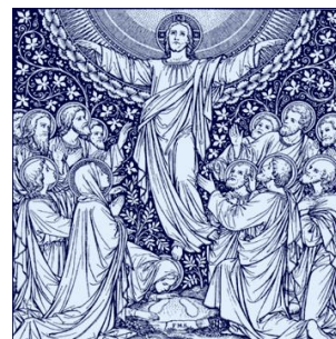
May 17, 2012 – Ascension Thursday